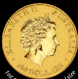
1oz obverse shown actual size