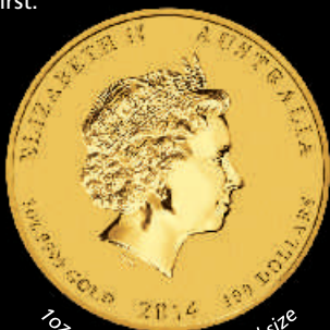
1oz obverse shown actual size